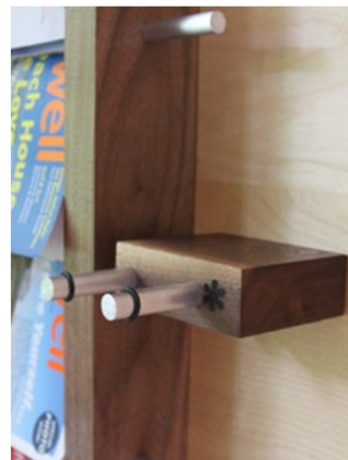
Optional Axe Rack